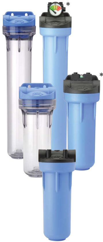
*Shown with differential gauge. Gauges sold separately.

VERSATILE DESIGN ACCEPTS MULTIPLE CARTRIDGE SIZES IN A VARIETY OF APPLICATION SETTINGS